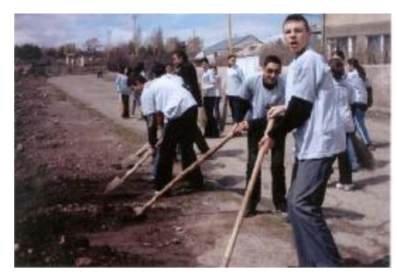
"Community is my house" pupils' action at school #4, Sevan

The Foundation has developed and published in English a reading manual for middle and high-grade schoolchildren. The aim of the manual is to enhance English skills of the learners and promote to the dissemination of ideas on Peace and Tolerance.