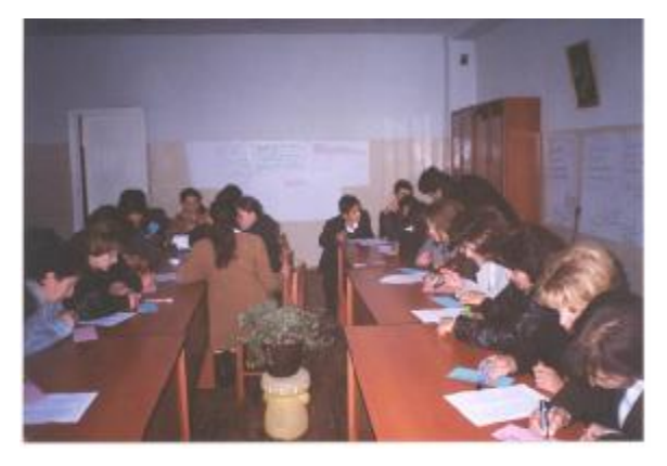
Training on Community development at the Community resource center of Chambarak school #3 in Gegharghunik Region.