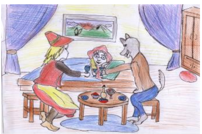
Azaryan Vachagan School #9, 12years old

Selected best essays and drawings were placed in Radiant Peace International Museum. You can see essays and drawings of some participant schoolchildren below.