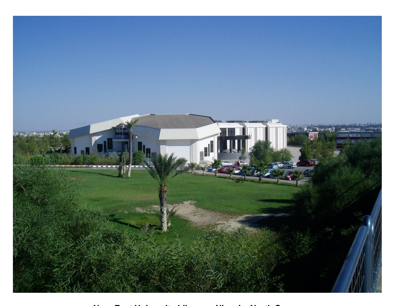
Near East University Library - Nicosia, North Cyprus