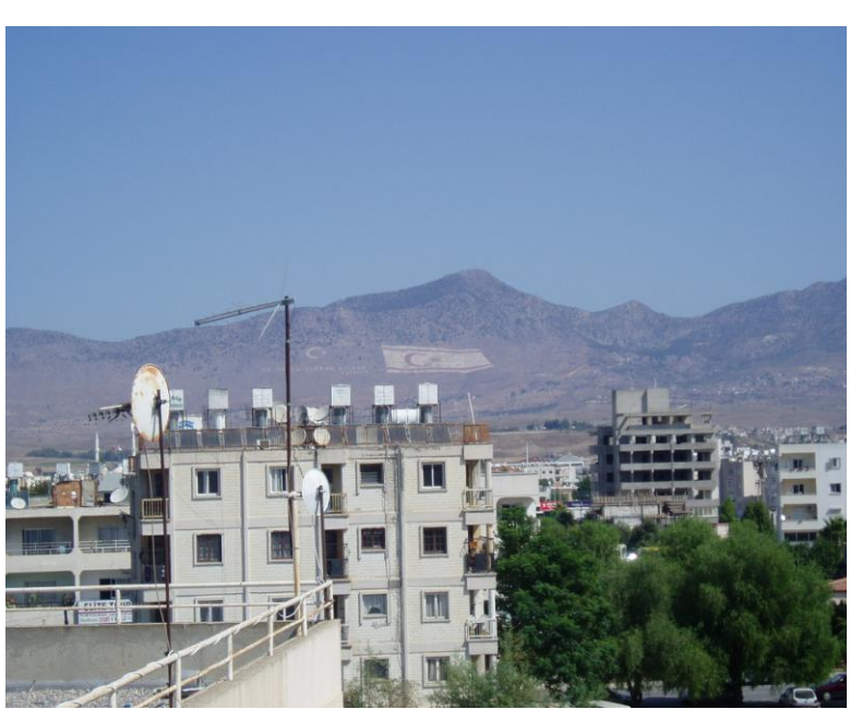
North Cyprus flag provocatively cut into the Hills overlooking Nicosia (it lights up at night)

Since 1974 United Nations peacekeeping forces have maintained a buffer zone, the Green Line between the Greek Cypriot Republic of Cyprus in the south of the island and self-proclaimed Turkish Republic of Northern Cyprus (TRNC). Repeated efforts at reunification have failed although numerous bi-communal activities have been organised around cultural events, social gatherings, training programs and joint projects.