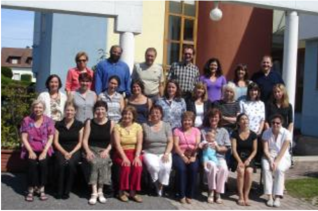
Schlaining, Austria 2006

The First UNESCO/EURED In -Service teacher training two-year course "Human Rights and Peace Education in Europe" was a real discovery for the organization. The training which consisted of five separate topics/seminars, was held in Spain, Germany, Hungary, Italy, Austria during the period of 2004-2006. 34 teachers, trainers and representatives of various NGOs of European 15 countries and United States participated in it. During these two years warm relations were established among the participants of the training course.