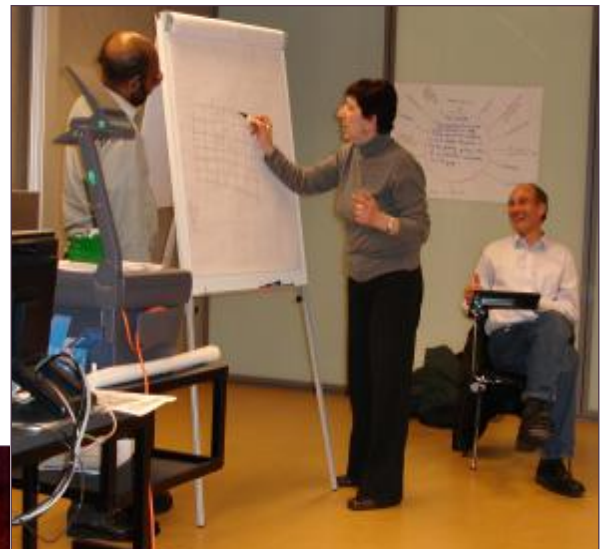
First UNESCO/EURED In -Service teacher training Course "Human Rights and Peace education in Europe" Brixen, Italy 2006