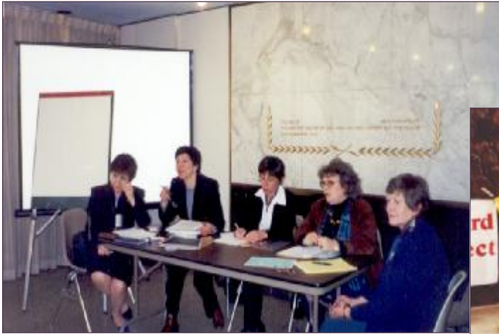
The 46 the Session United Nation Commission on the Status of Women New York, USA 2002