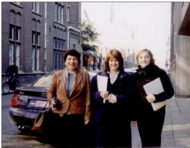
"European Studies" Conference Leuven, Belgium 2003