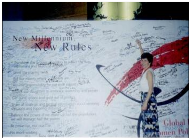
"Women for Development" NGO