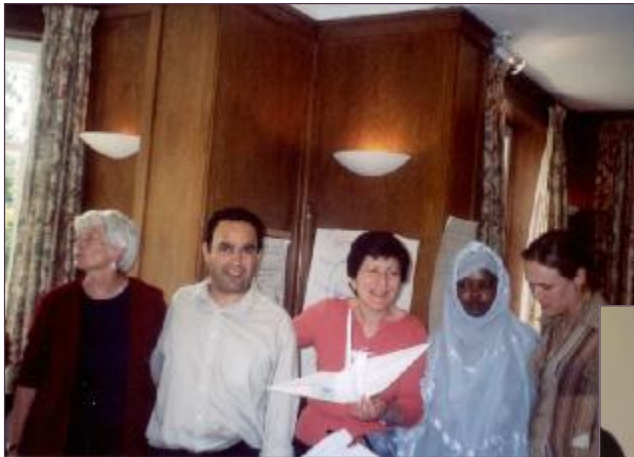
Strengthening Policy and Practice workshop, Practical Strategies for Agencies working in Areas of Tension and Conflict. Responding to Conflict Birmingham, UK 2003