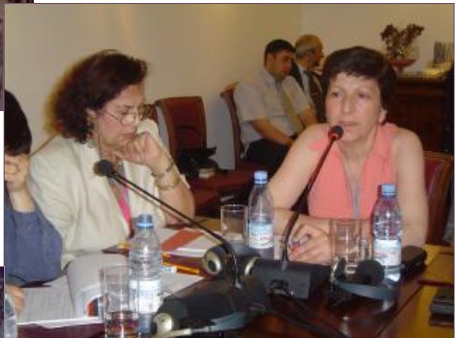
Caucasian forum of Women Global Fund grantees Tbilisi, Georgia 2006