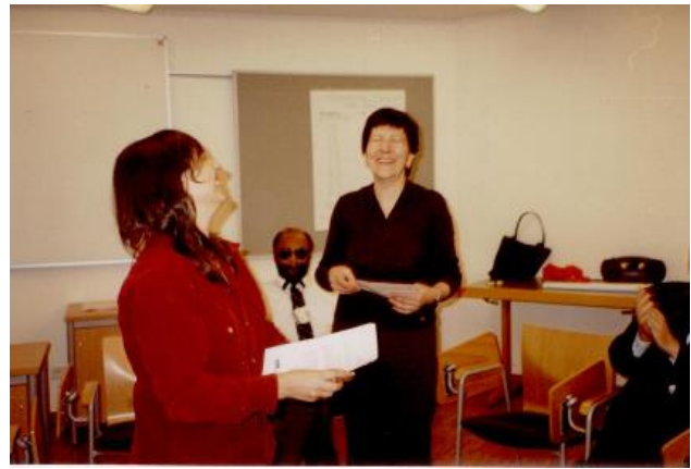
Magdeburg, Germany 2005