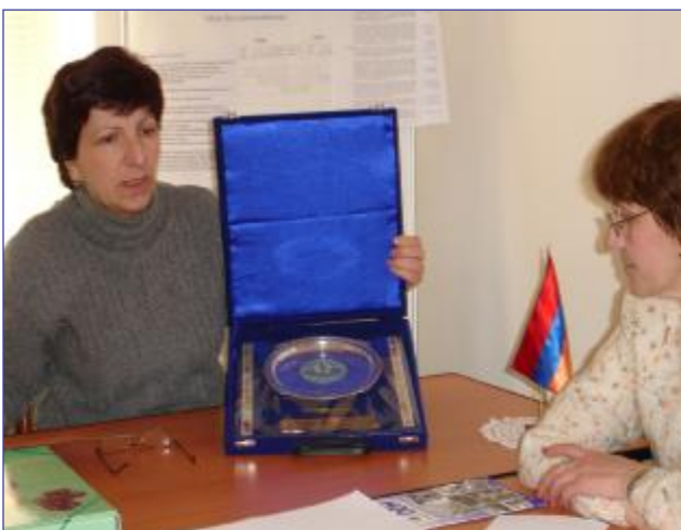
The presentation of the participation certificate of the summit to the WFD staff