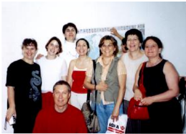
Gernike, Spain 2004