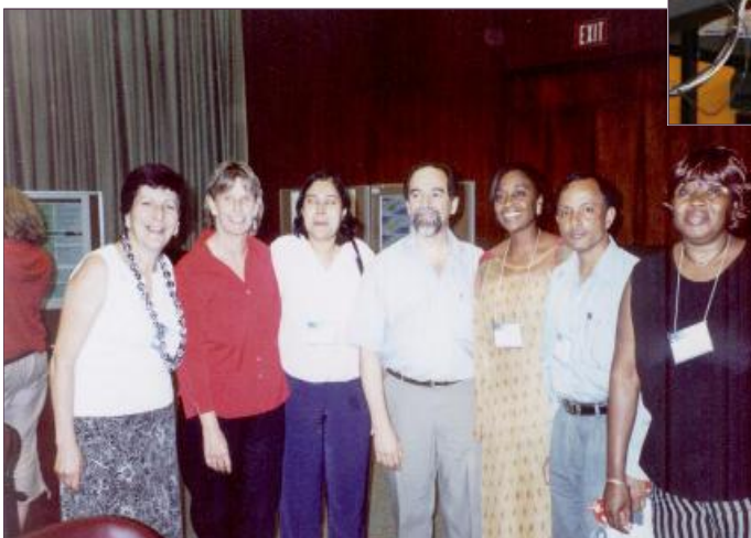
"Gender Equality and Disaster Risk Reduction" international conference Honolulu, Hawaii, USA 2004