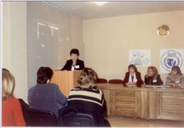
The first conference of Armenian "Peace Coalition" Tsaghkadzor, Armenia 2003