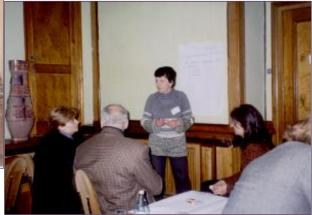
Caucasus regional meeting Likani, Georgia 2004