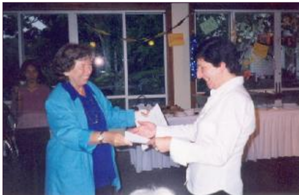
School for International Training Peacebuilding I Conflict Transformation Across Cultures (CONTACT) Summer Institute Vermont USA, 2002