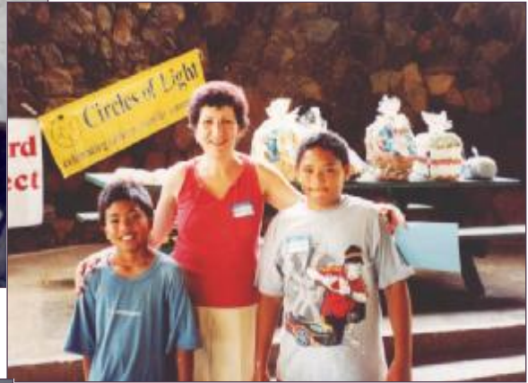
"Circles of light" organization Honolulu, Hawaii, 2004