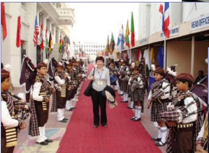
The opening ceremony of the summit