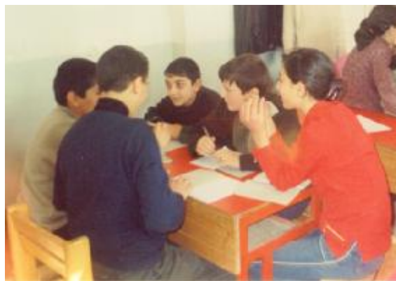
School # 7

Conflict is the quarrel of one or more people, which occurs because of one reason.