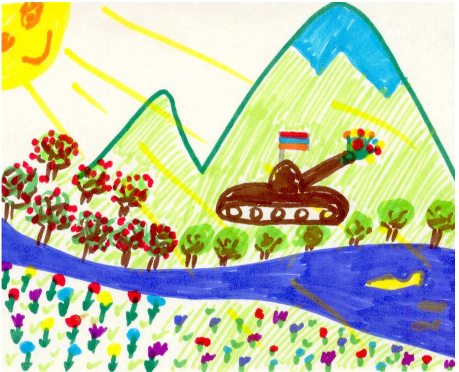
Hayrapetyan Gevorg's Drawing

Newspaper #3, 2003 of Peace Education Centers