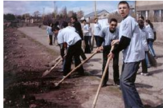
“Community is my house” pupils’ action at school #4, Sevan

The Foundation has developed and published in English a reading manual for middle and high-grade schoolchildren. The aim of the manual is to enhance English skills of the learners and promote to the dissemination of ideas on Peace and Tolerance.