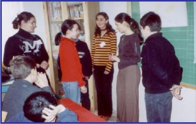
school # 7

With its own initiative, each group also thought of a small performance, presenting some conflict situation. The performed conflict was deepening because the participants didn't have appropriate knowledge and skills