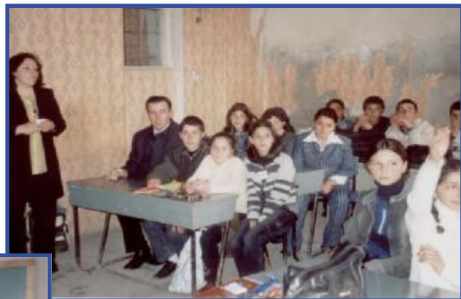
school # 29