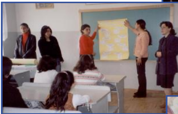
school # 30