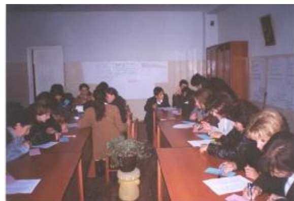
Training on Community development at the Community resource center of Chambarak school #3 in Gegharghunik Region.