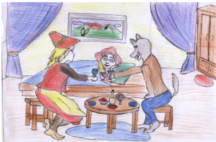
Azaryan Vachagan School #9, 12years old

Selected best essays and drawings were placed in Radiant Peace International Museum. You can see essays and drawings of some participant schoolchildren below.